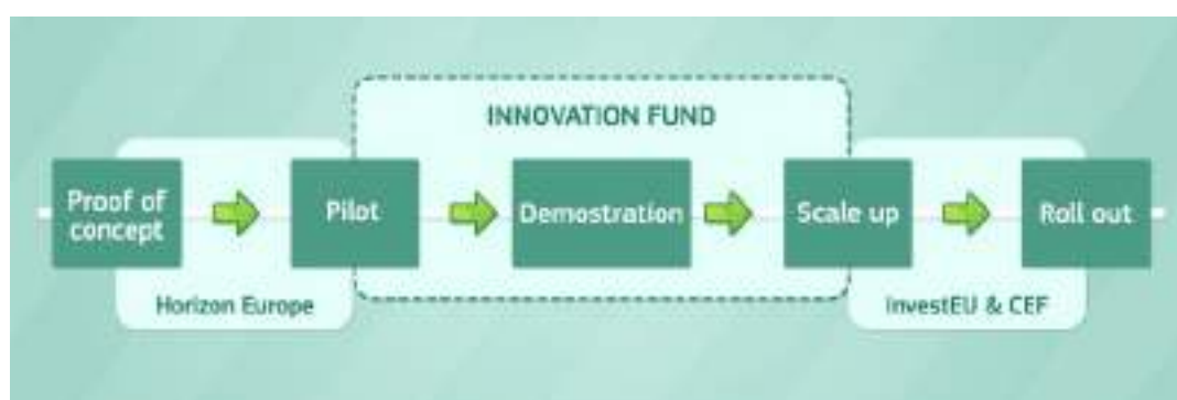
Figure 1: Possible EU industrial innovation financing instruments from proof of concept to roll out.

The main instrument to bridge the pilot/demonstration to commercialisation gap will be the EU ETS innovation fund. The innovation fund will make available around EUR 10 Bn for the demonstration of breakthrough technologies in the energy and industrial sectors in the period 2020-2030. The fund solves many issues that hampered its predecessor (NER300), in particular the lack of upfront financing. First of all, the fund will give project developers early access to capital, even before the construction of the demonstration technology. Secondly, the innovation fund will also cover part of the (possibly) higher OPEX compared to incumbent technologies. Thirdly, the fund will allow blended finance with other EU financing instruments (e.g. Invest EU). Finally, the set-up of the innovation fund contains support at an early stage for the development of project proposals.